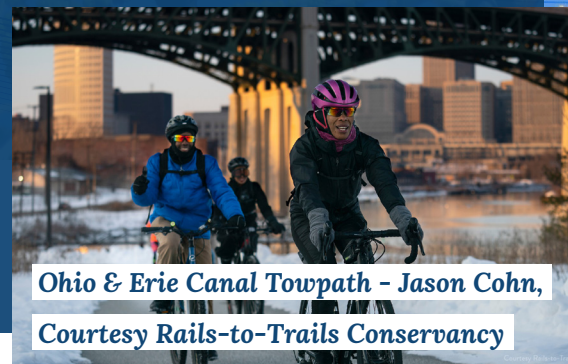
Ohio & Erie Canal Towpath

Rails to Trails Conservancy is a national organization reimagining public spaces and connecting communities via trails. In 2023, they came to ICL to create a five-year strategic plan. Their goal is to ensure that trails and trail networks are prioritized as essential for people, communities, and the environment.