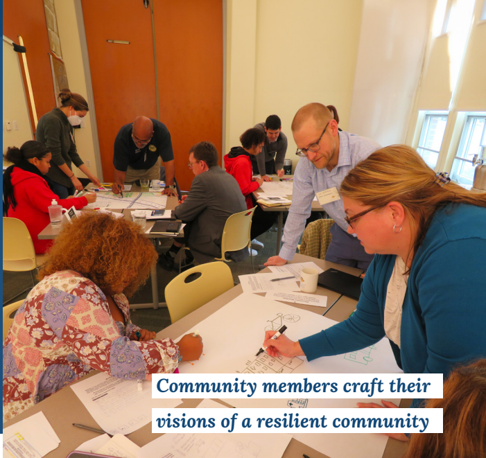
Community members craft their visions of a resilient community

During the first half of 2023, ICL facilitated a community engagement and data analysis study with the Berks County Community Foundation to help address environmental issues raised by community members. Over 45 Berks County leaders from government agencies, nonprofit organizations, and local businesses met with the Community Foundation to discuss community resiliency and community health. Analyzing the input to pinpoint approaches for funding environmental work in the county, ICL identified recommendations captured in a detailed report for the foundation.