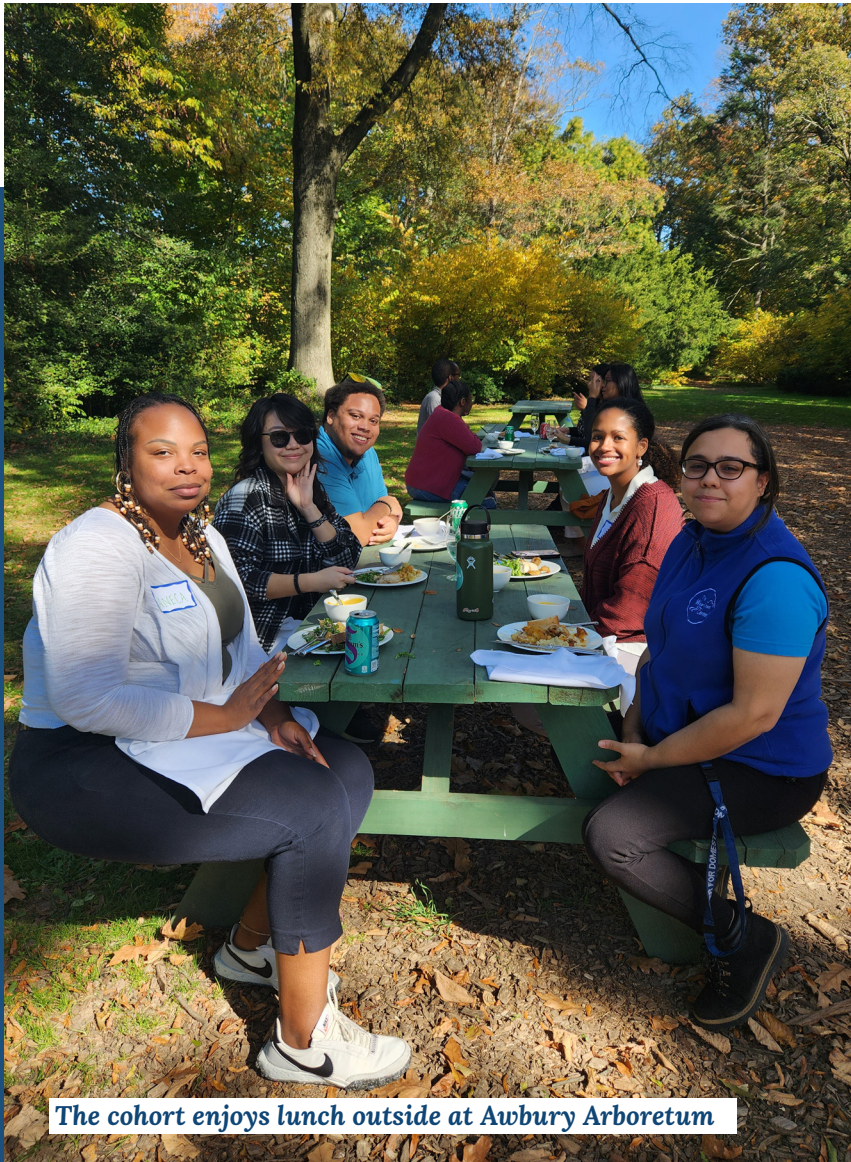
The cohort enjoys lunch outside at Awbury Arboretum